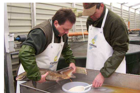
A female which has returned to a tributary the Rhine river is stripped of her eggs in a hatchery that is run by sport anglers.