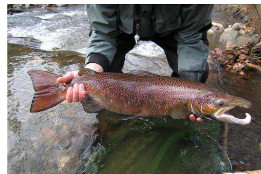
A returning male salmon is caught by electrofishing gear.