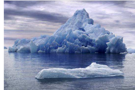
Icebergs at the Greenland feeding area.